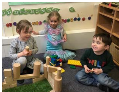
"What do you think of that?"

From all of us at Quinton Primary School